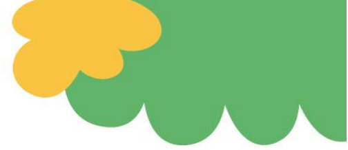
Table of Abbreviations and Acronyms